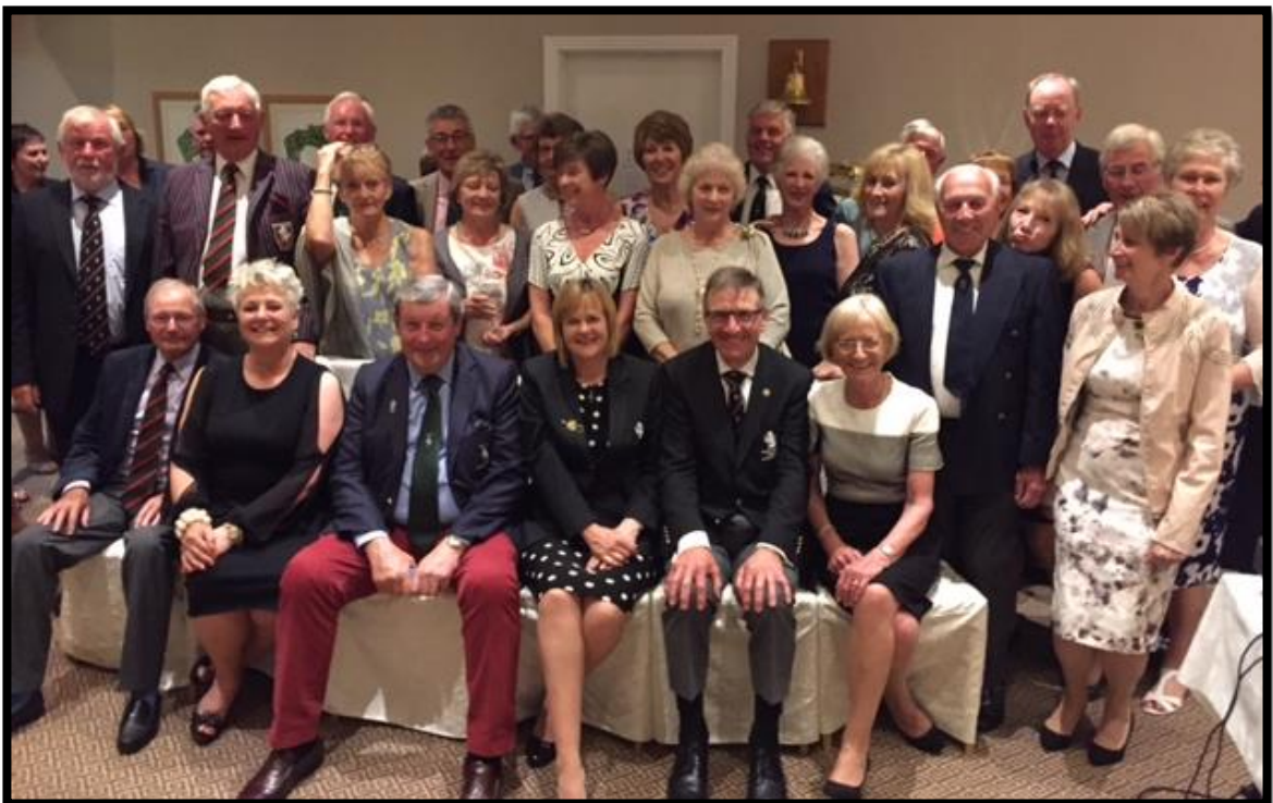
The West Kent Team with the Captain and Vice Captains.