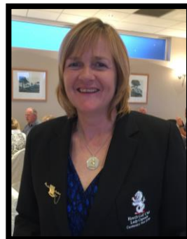
Our Lady Captain with her Centenary Medal