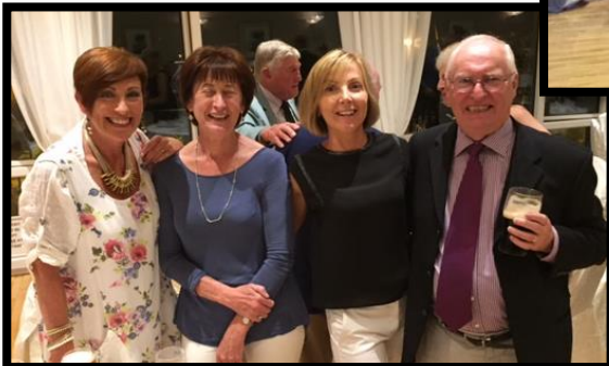
Our members enjoying our newly renovated dinning room.