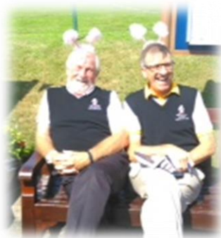
And Best Dressed Men!!!!