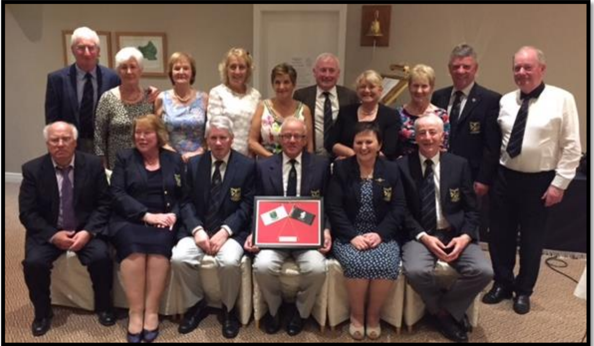
Rosmore GC Team