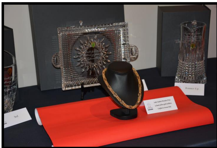
Lady Captain' Prizes